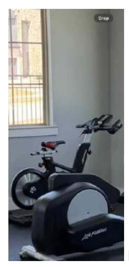
Bike proposed to replace